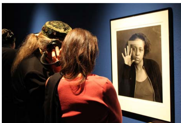
Table of Contents: Stories of Hunger and Resilience by Michael Nye Piper Memorial Wing The Witte Museum 3801 Broadway San Antonio, TX 78209